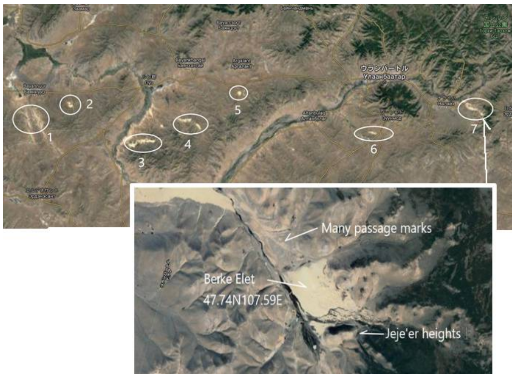
Fig.1 Sandy places in the area of the Kereyit and a place presumed to be Berke elet.

The place where Nilqa Sengguem and Jamukhas planned to kill Temuejin.